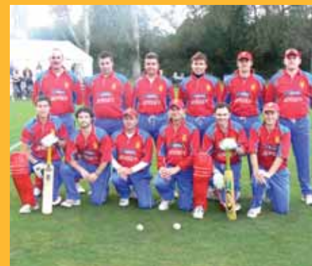
Jersey hopes home advantage will boost its qualification chances for the ICC Cricket World Cup 2011.

Promotion and relegation are possible between divisions as each team seeks to move up the world cricket rankings.