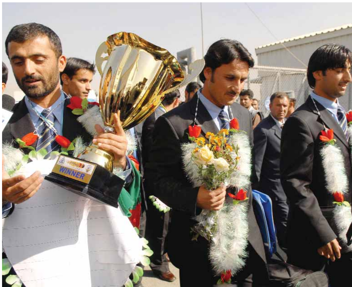
Afghanistan will be hoping to repeat their success at the ACC Twenty20 Cup in 2007.

Twelve ICC Members will be hoping to move closer to qualification for the ICC Cricket World Cup 2011 when they take part in the ICC World Cricket League Division 5 in Jersey.